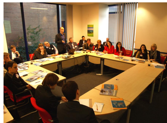
Meetings at the EU Commission in Brussels