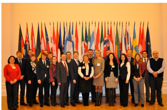
Visit to the OECD in Paris