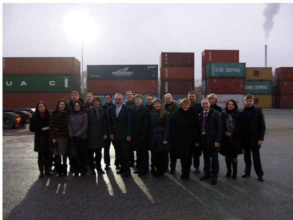
Visit to the Port of Vienna