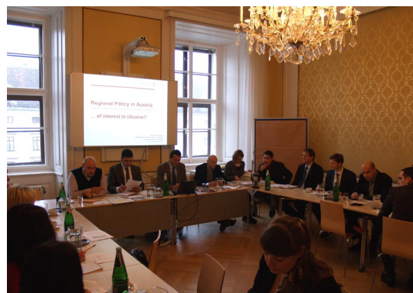
Discussions at the Austrian Spatial Planning Conference (ÖROK)