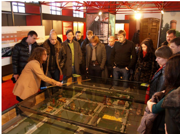
Visit of the water treatment plant in Warsaw