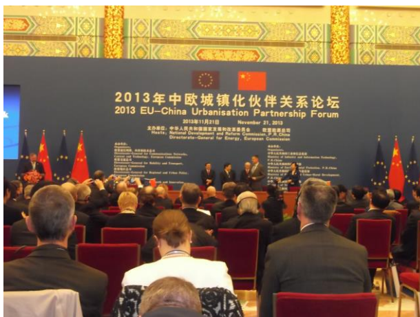
Participation at the EU-China Urbanisation Partnership Forum