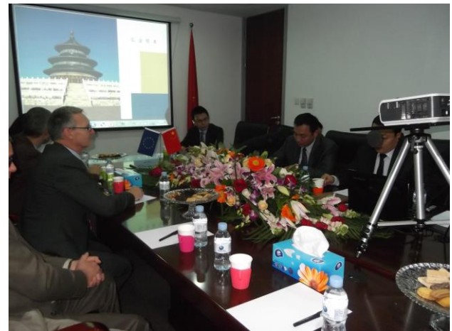
Meeting with Venture Capital Company in Beijing