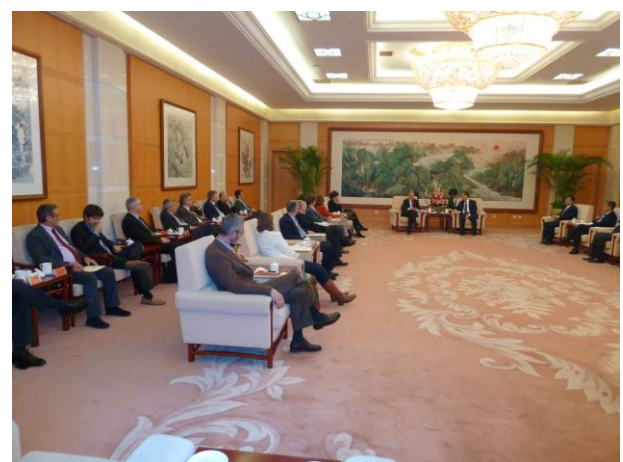
Meeting with the Executive Mayor of Tianjin