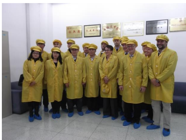
Visit to the production site of Fiberhome, Wuhan