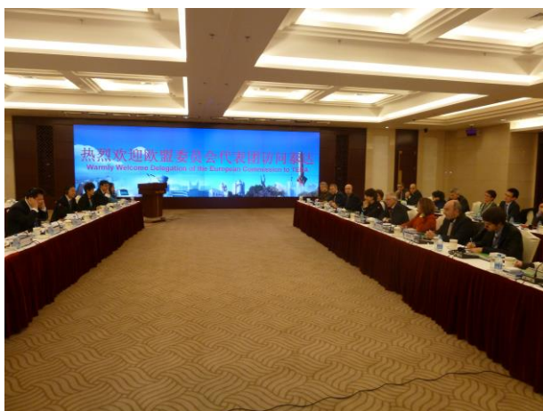
Participation at the EU-China Urbanisation Partnership Forum