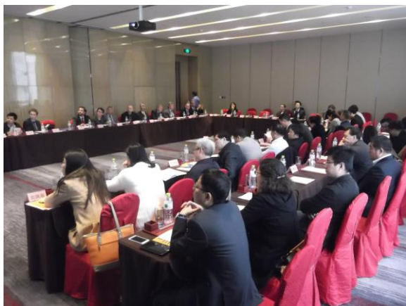
Workshop in Wuhan