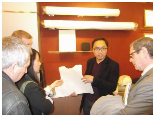
Visit of a company at E-Town, Beijing