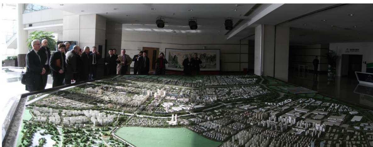
Field visit to the Beijing E-Town – Economic Technological Development Area