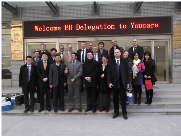
Visit of the Pharmaceutical Company Youcare, Beijing E-Town