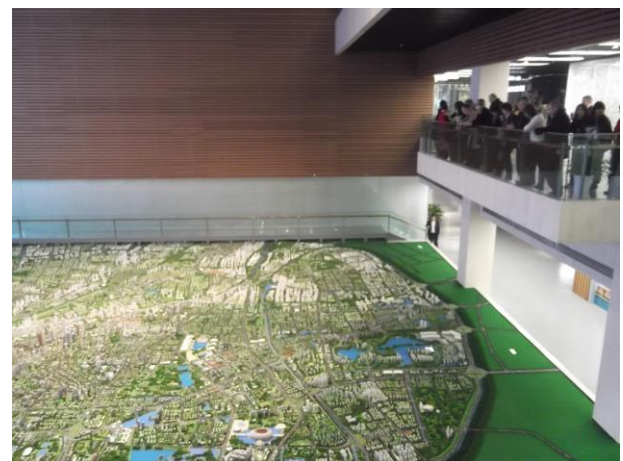
Modell introduction at Tianjin Urban Development Centre