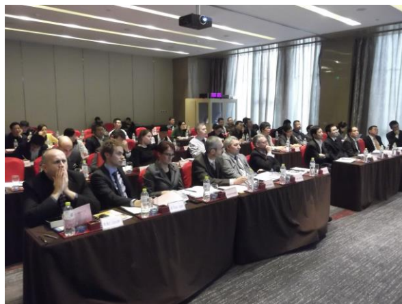
Workshop in Wuhan