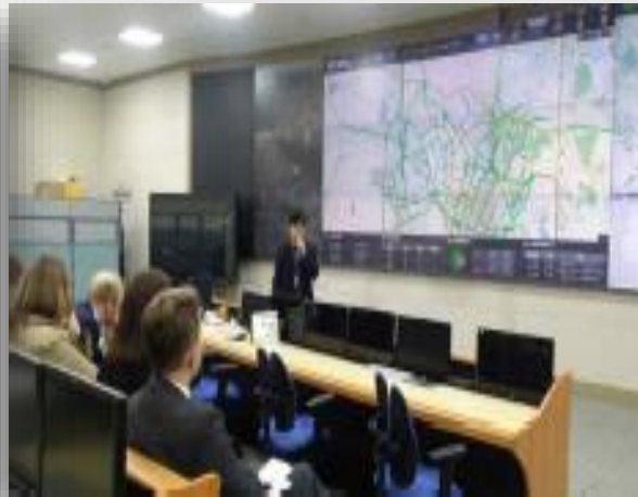
Suwon Smart City Center