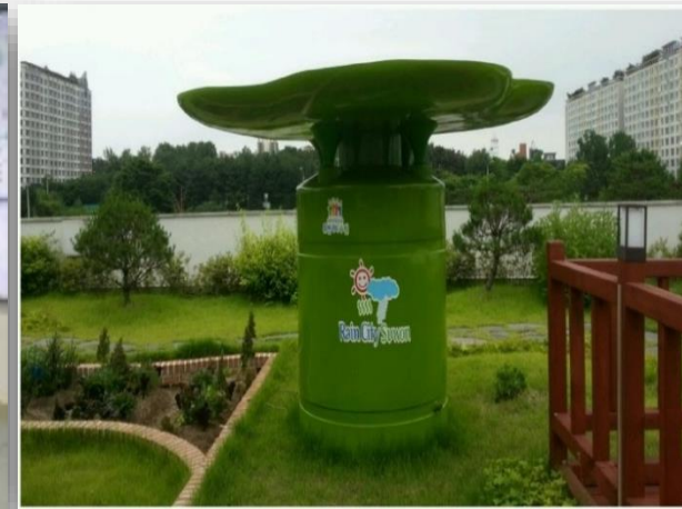
Reuse of Rainwater for Urban Gardening