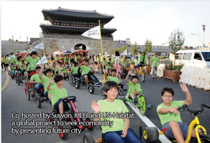
Co-hosted by Suwon, ICLEI and UN-Habitat, a global project to seek ecomobility by presenting future city