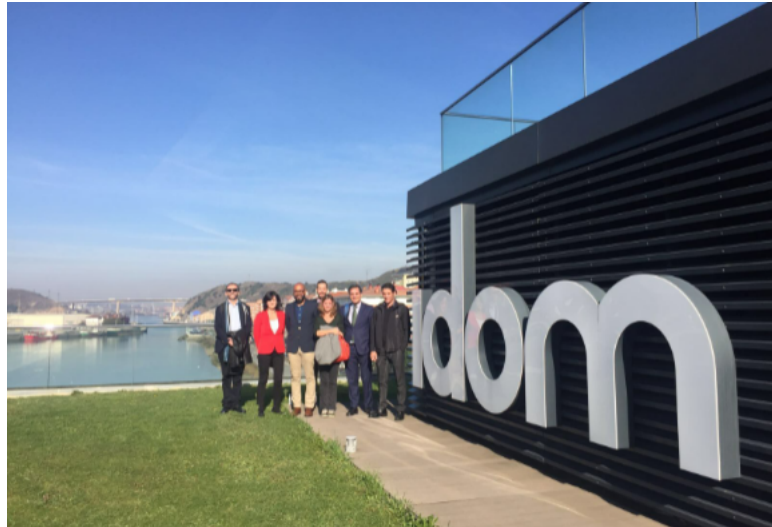
Visit to Idom's Headquarters