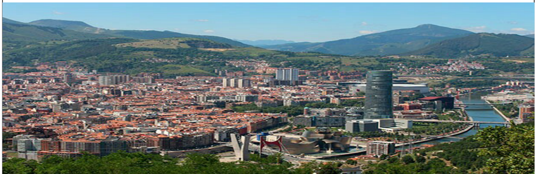
View of Abandoibarra area