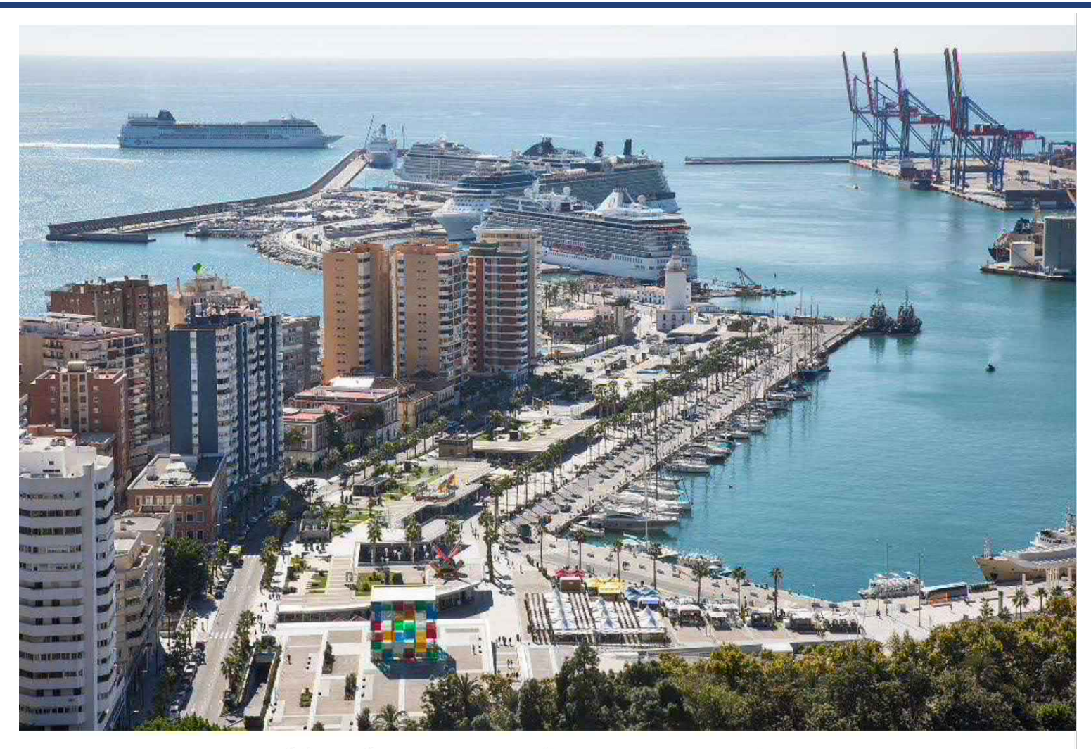
Old Dock nº 1, pompidou Museum, and tourist cruise